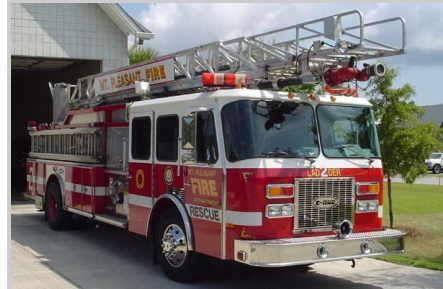
A ladder truck like this one is needed to serve buildings with large footprints and buildings taller than two stories.

Emergency medical service response of eight minutes is good in most locations. Quicker EMS response is advantageous.