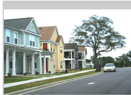
A HOPE VI community, like Horizon Village in North Charleston, mixes public, subsidized, and market-rate housing units.

Despite the regional trend, Dorchester County maintains the best housing affordability in the area. In 2006, a family of four earning the area median income of $56,030 could afford a home price of $168,090 (assuming three times the yearly income is deemed affordable). Dorchester County misses that mark by $26,810 with a median sales price of $194,900. As more residents move in, high demand and escalating land values will expand this gap significantly, particularly if production does not keep pace with demand.