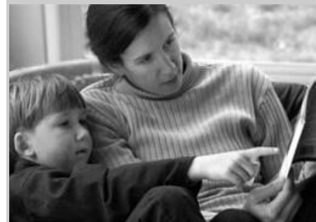
Workforce housing initiatives help single parents across the country, like this mother and son in Jackson, WY.